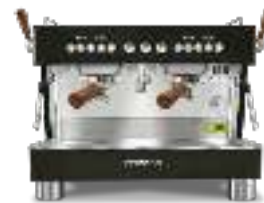
2GR Compact Black&Wood