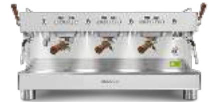
3GR Full Inox