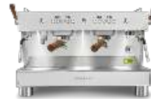
2GR Full Inox