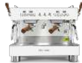
2GR Compact White&Wood